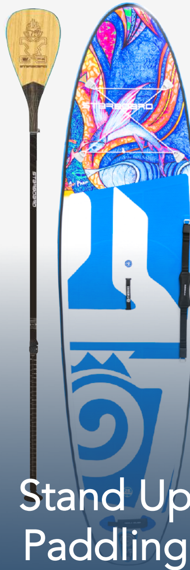
Stand Up Paddling